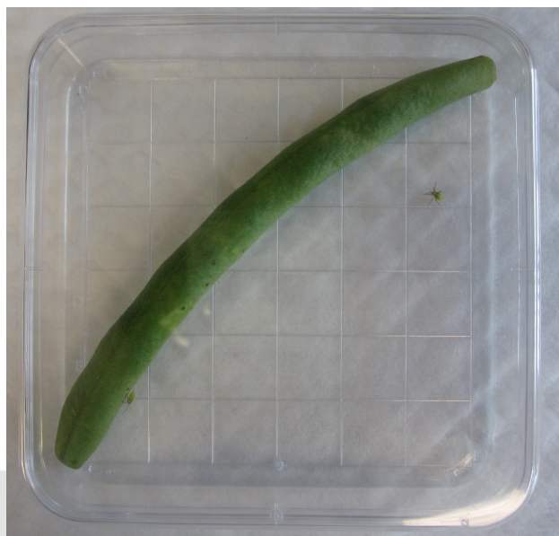
Figure 1. Treated green bean infested with Lygus.