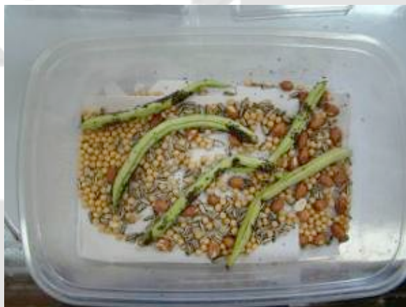
Figure 1. Stink bugs maintained on bean pods and seeds in the lab.