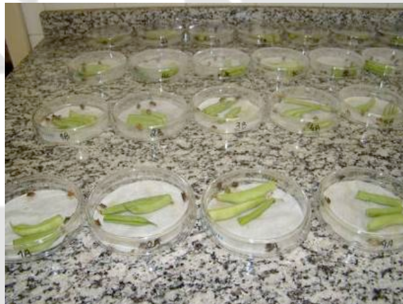
Figure 4. Test in progress.