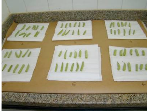
Figure 3. Treated bean pod pieces drying on paper towels (photo courtesy BASF).