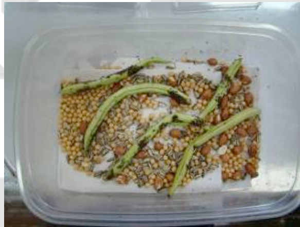
Figure 1. Stink bugs maintained on bean pods and seeds in the lab.