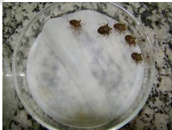
Figure 2. Petri dish test arena with moistened filter paper.