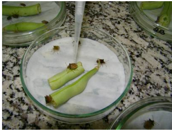
Figure 3. Applying test compounds to the dorsum of the insect.