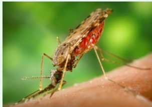
Adult Anopheles albimanus feeding

In the coastal plain of Chiapas, Mexico, a large scale field trial was undertaken from 1996-2002 to evaluate rotations and mosaics of insecticides. The site was chosen because of the extensive history of insecticide use in Mexico. Extensive agricultural and public health insecticide used during the 1960's and 1970's selected multiple insecticide resistance mechanisms in Anopheles albimanus , the main coastal malaria vector. Subsequent changes in land use, the reduction in cotton farming and the success of malaria control activities consequently decreased Insecticide use.