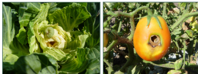
S. exigua damage to cabbage and tomato

The larvae are gregarious and may feed in large swarms, causing devastating crop losses. Larvae feed on both foliage and fruit. As they mature, the larvae become solitary. Damage includes consumption of fruit and leaf tissue and contamination of the crop. One generation can be produced in as little as 21-24 days.