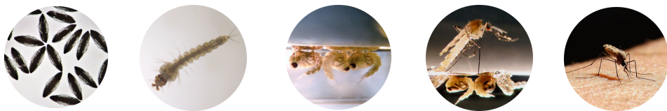
Resistance impacts Vector Control programmes here

Insecticides have been extensively used since the 1940s to control the mosquito vectors of disease, and have been a vital component in the fight against malaria. However, resistance has developed and is widespread in populations of the major mosquito vector species to the four classes of insecticide currently recommended for adult vector control. As insecticide resistance continues to develop and spread, there is a real danger that these valuable tools will be lost.