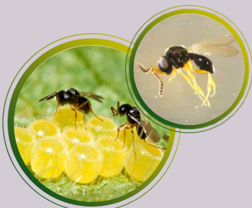
Egg parasitoids: Trissolcus basalisi , Telenomus podisi .