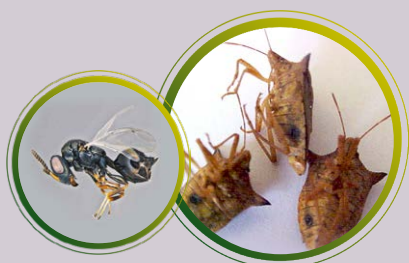
Stink bug parasitoids: Hexacladia smithii .