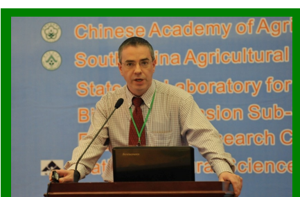
Bemisia Workshop, Guangzhou, China