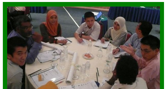
One of the World Café Discussion Groups