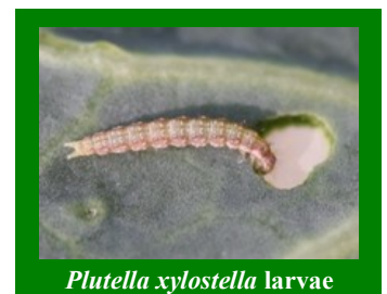
Plutella xylostella larvae

The availability of standard, validated and easy-to-run, ‘IRAC-approved’ methods for resistance detection in the world’s major pests is crucial for successful monitoring of resistance problems. The methods team is responsible for ensuring that IRAC has available a suite of up-to-date methods to meet this need and are responsible for coordinating the development and validation of new methods and for preparing them for inclusion on the website