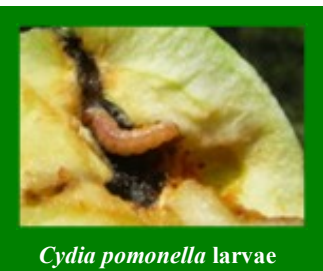
Cydia pomonella larvae

The availability of standard, validated and easy-to-run, ‘IRAC-approved’ methods for resistance detection in the world’s major pests is crucial for successful monitoring of resistance problems. The methods team is responsible for ensuring that IRAC has available a suite of up-to-date methods to meet this need and are responsible for coordinating the development and validation of new methods and for preparing them for inclusion on the website