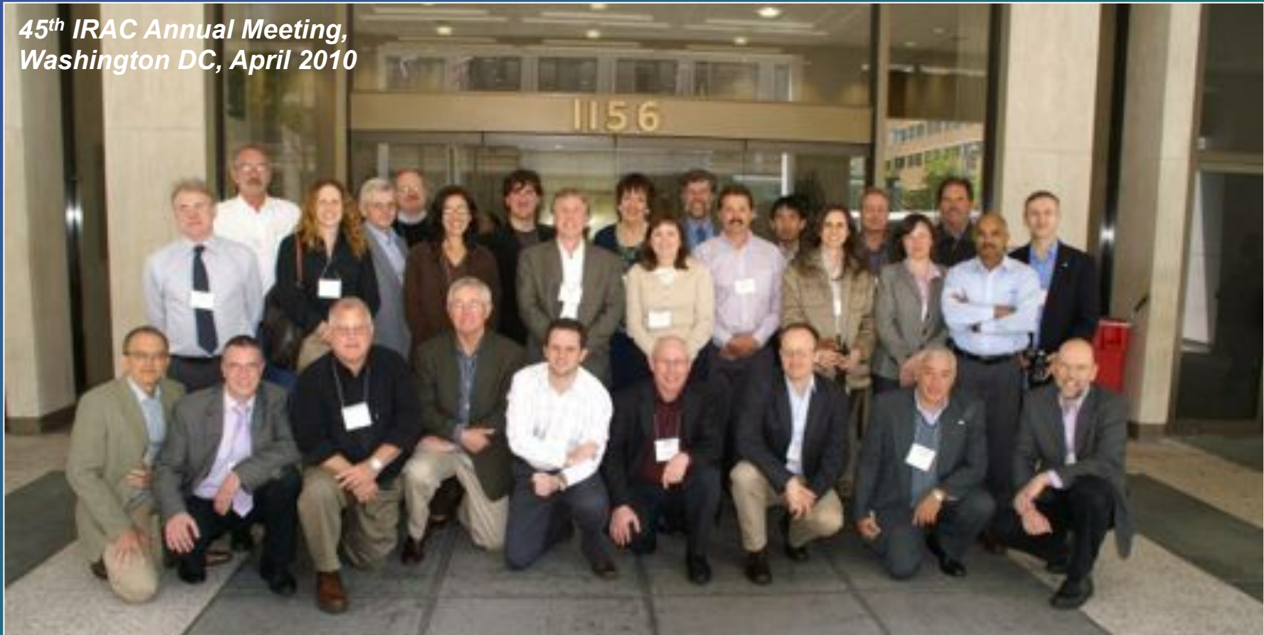
45 th IRAC Annual Meeting, Washington DC, April 2010