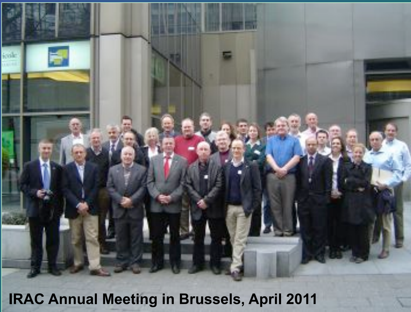
IRAC Annual Meeting in Brussels, April 2011