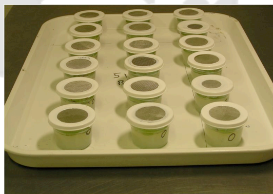
Fig 2: Aphid Infested test containers