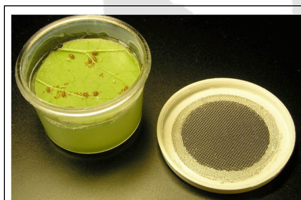
Fig 1: Aphid infested test container and ventilated lid